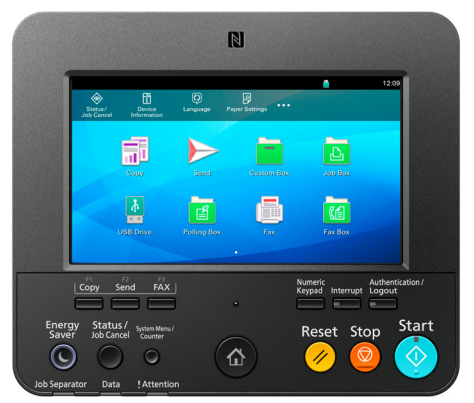
TASKalfa 508ci / 408ci / 358ci control panel